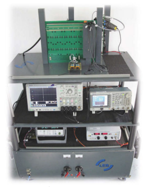
Fig. 4: Low-inductive measurement setup for dynamic device evaluation up to 2000 V, 100 A.